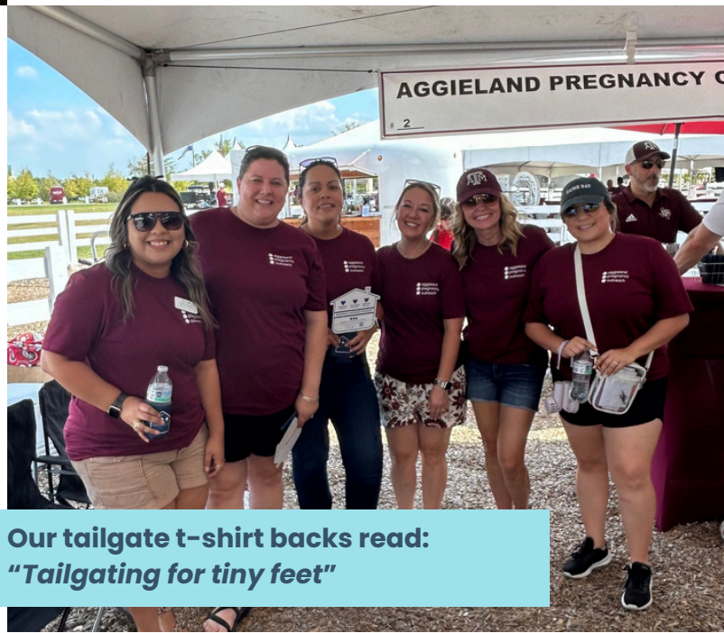
Our tailgate t-shirt backs read: "Tailgating for tiny feet"

Our BV Gives Goal is $100,000. We have a $50,000 match secured. This means your gift is doubled in impact. A gift of $1,000 = $2,000!