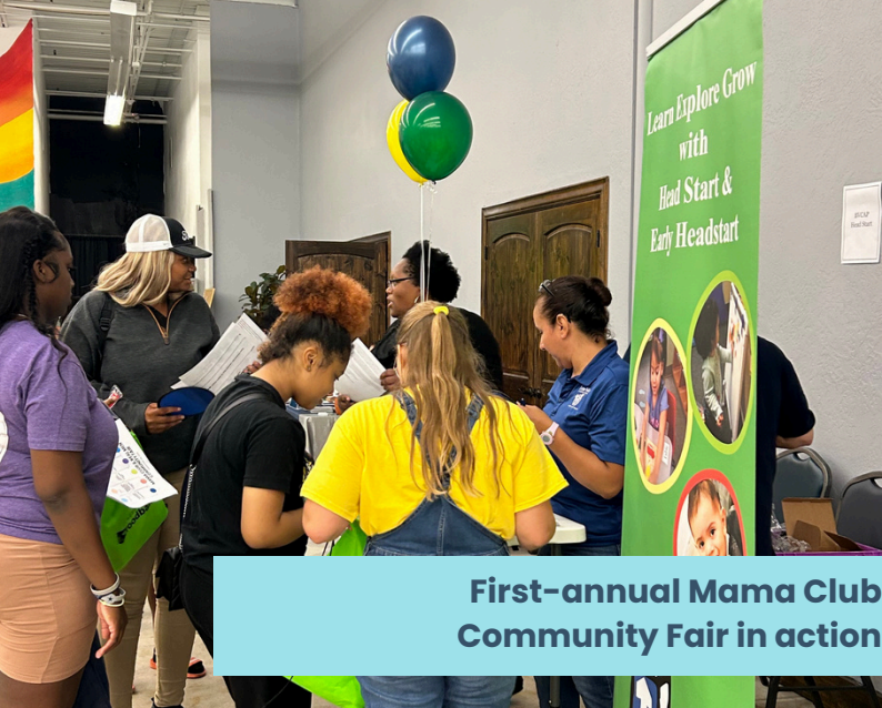
First-annual Mama Club Community Fair in action