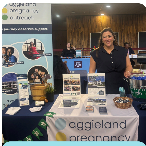
This fall provided meaningful outreach opportunities to share our services.