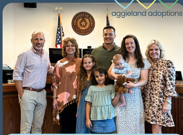
Congratulations to this sweet family on their son's adoption finalization.